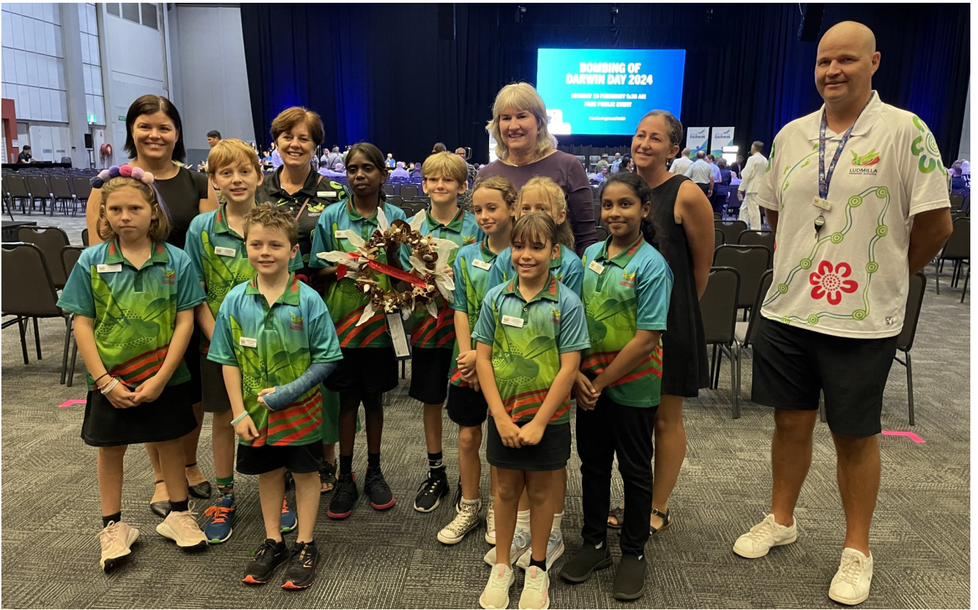
On the 19 th February we pause to commemorate the Anniversary of the Bombing of Darwin. Our Student Leadership Council joined other schools and young people attending the Commemorative Service to remember the Bombing of Darwin in 1942.